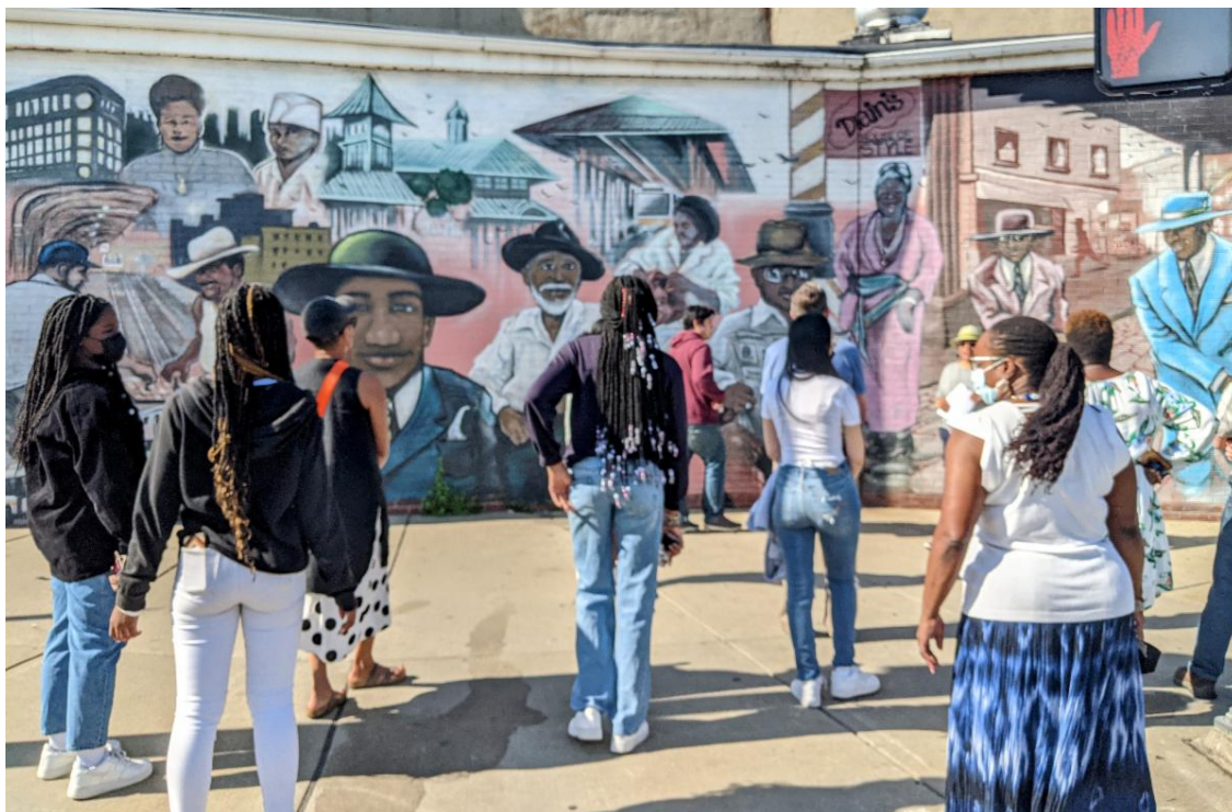
Young people listening to a student-led tour in Roxbury during Seeing Me in the World

We believe history is not just something you read about. It is something you experience. It shapes the way we see ourselves in the world. Seeing Me In the World was created by students, for students, to bring history to life in a way that feels real and relevant. This two-hour program and tour, facilitated with the help of students from UUUM's youth program, invites young people to engage with Roxbury's past and present through their own lens.