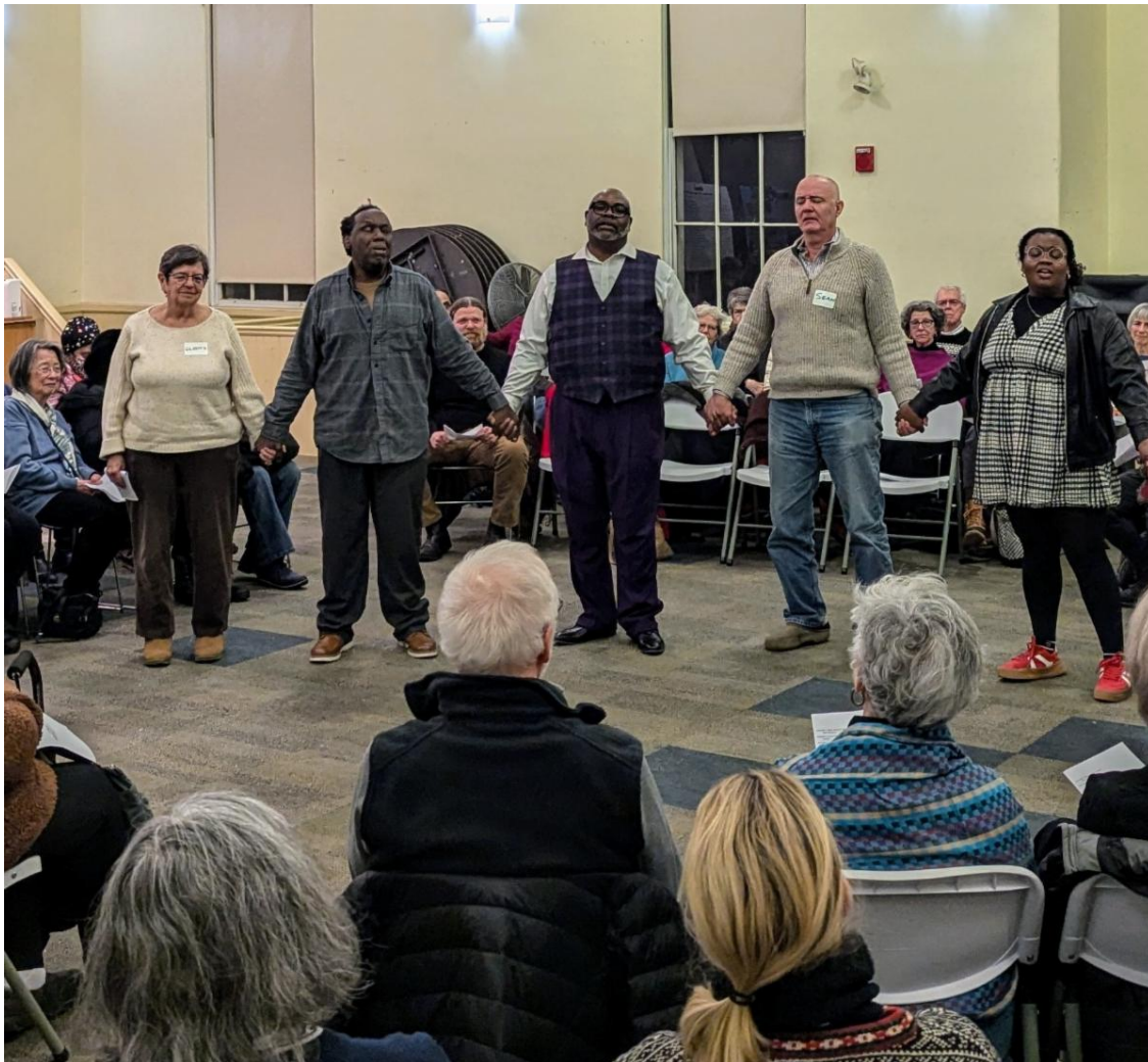
A scene from this year's "The Ties That Bind" concert honoring Dr. Martin Luther King, Jr.

To understand where we are now, we have to look back - even as we press forward. In unsettled times, the justice work of the UU Urban Ministry continues, steadfast. We support college-bound BIPOC students and domestic violence survivors rebuilding their lives. We partner with Roxbury organizations to walk together for a fairer future.