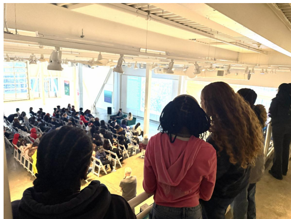
RYP students listening to the lecture at Artist for Humanities.

This was a great opportunity to meet the artist, see his work, and network with other young people.