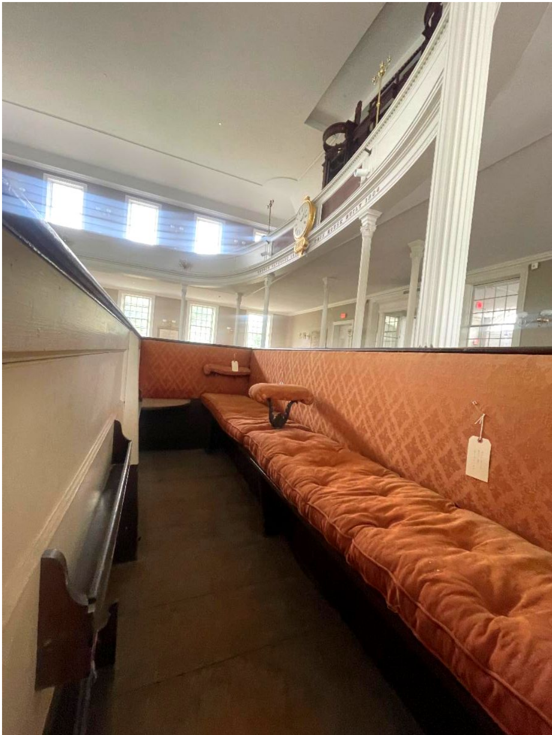
An original pew from the Fifth Meetinghouse, preserved during the renovations.