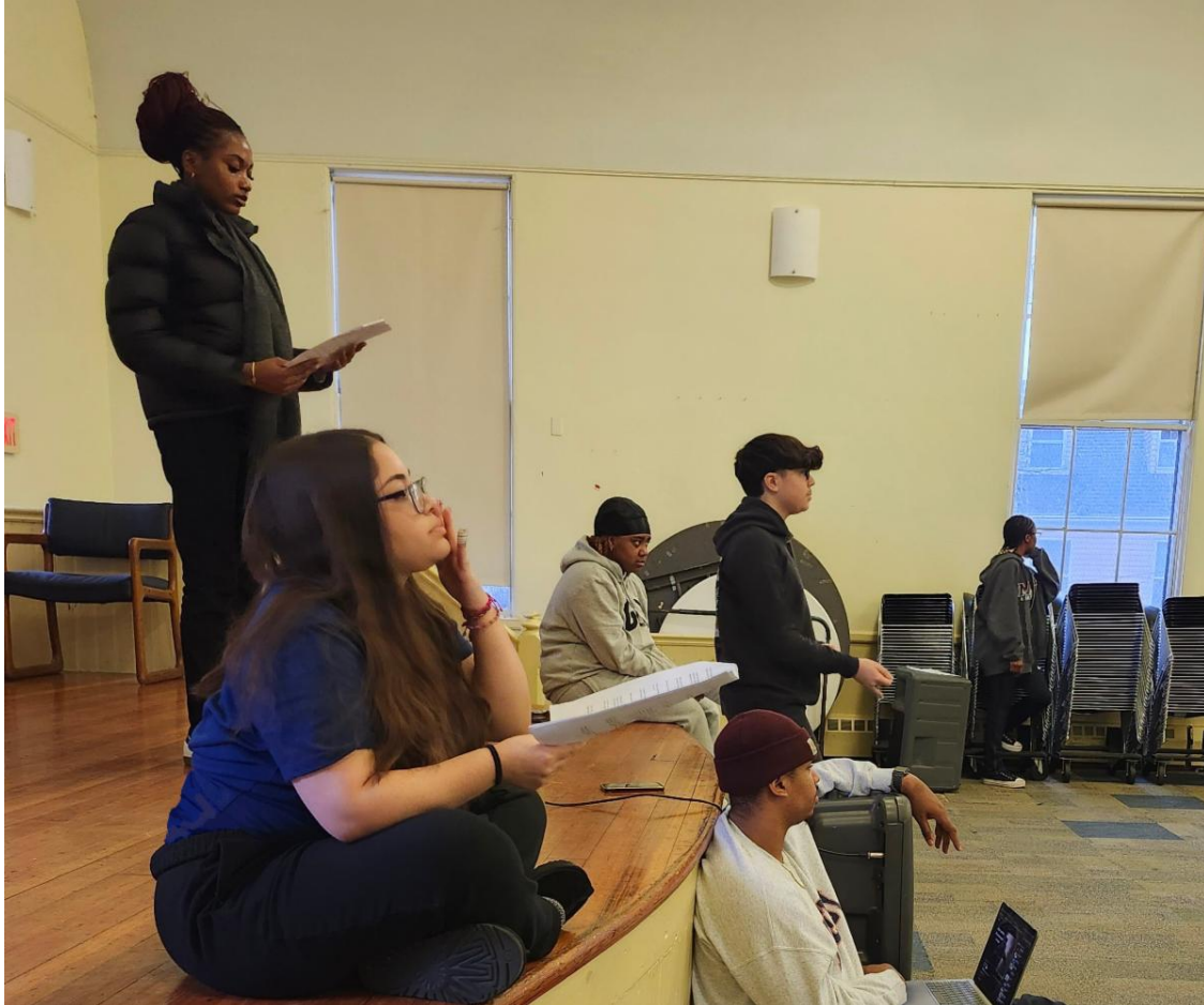
RYP students in Putnam Hall rehearse the play that they are producing during this semester of the program.

One way that Roxbury Youth Programs (RYP) helps provide young people with space to develop their voices and opportunities is through art and artistic expression.