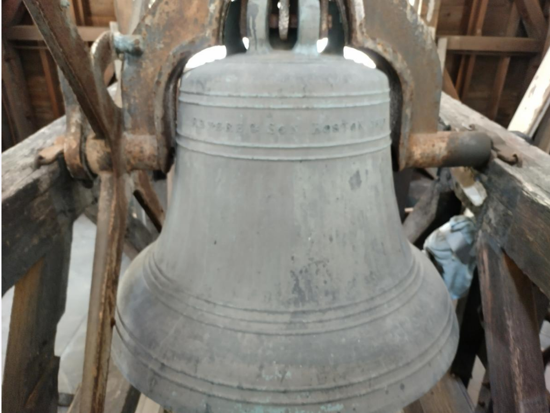
Embossed across the front of the bell are the words, "Revere & Son 1819"