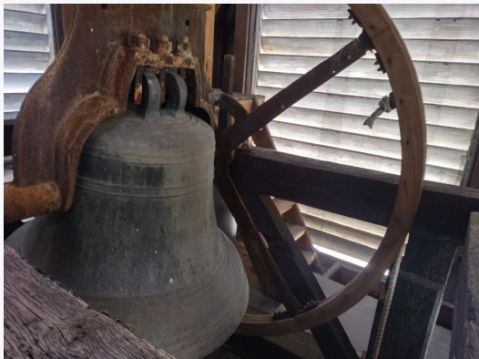
If you've ever pulled the rope in the doorway of the Meetinghouse to ring the bell, it is attached to this large wood wheel, that turns and swings the bell, causing it to ring.