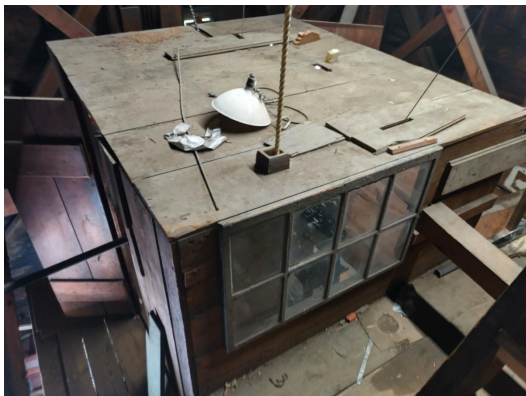
High inside the steeple of First Church Roxbury, looking down on the small room that houses the mechanism that controls the clocks.

Our clock winding team is an amazing group of neighbors who keep the clock running and the Meetinghouse bell tolling. We hope you can join us and stay for some jazz.