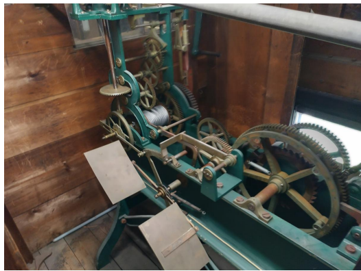
The mechanism that our clock winders wind every 6-7 days to keep the clock ticking accurately and the church bell ringing to mark the hour.