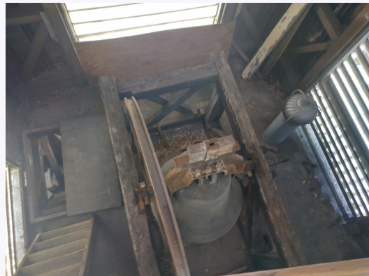
Looking down at the bell from the stairs that lead to the top of the Meetinghouse steeple.