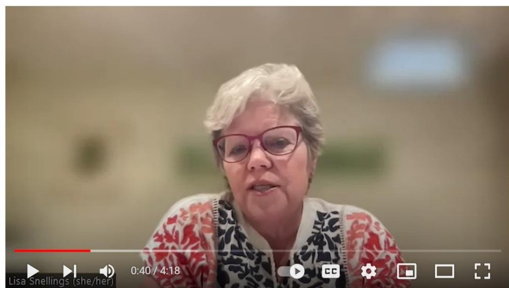
Jubilee Three Anti-Racism Training: The Opportunity & The Experience