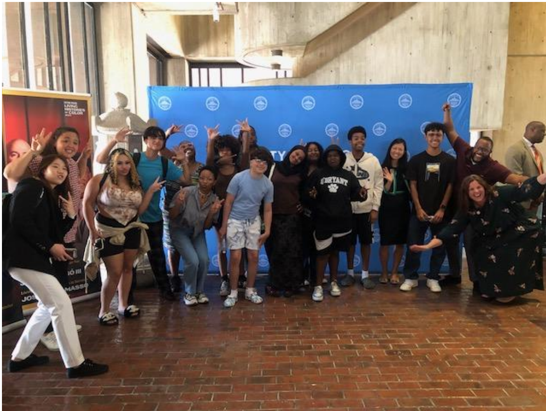
RYP Summer Interns on their recent field trip to Faneuil Hall and Boston City Hall

The students participating in the summer semester of Roxbury Youth Programs (RYP) have been working hard - both in and out of the classrooms here in Roxbury.