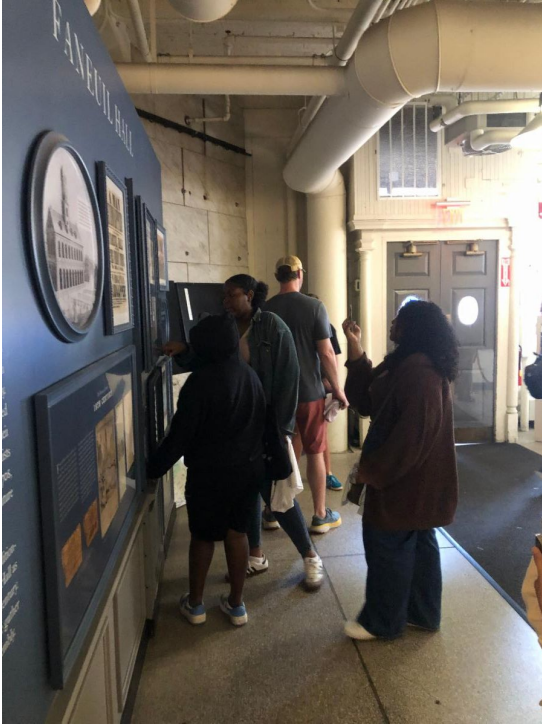
RYP students visiting the Boston slavery exhibit at Faneuil Hall

more than 1,300 individuals who have been identified, though in many cases their names and other personal details remain unknown.