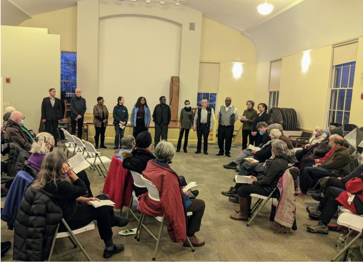
Photo from the Ties That Bind event in January 2023

A new year can mean a fresh start. But in 2024, the world's heaviness weighs on us. And that means we must seek inspiration to start, afresh.