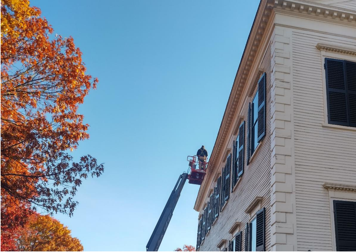
Workers in the cherry picker doing work at roof-level.

This photo taken from the raised pulpit encompasses a lot of the current efforts inside the Meetinghouse. You can see the middle section of the box pews - the cushions removed and the wood being sanded and repaired. Laying in the middle aisle are pipes that will be part of the building's new sprinkler system.