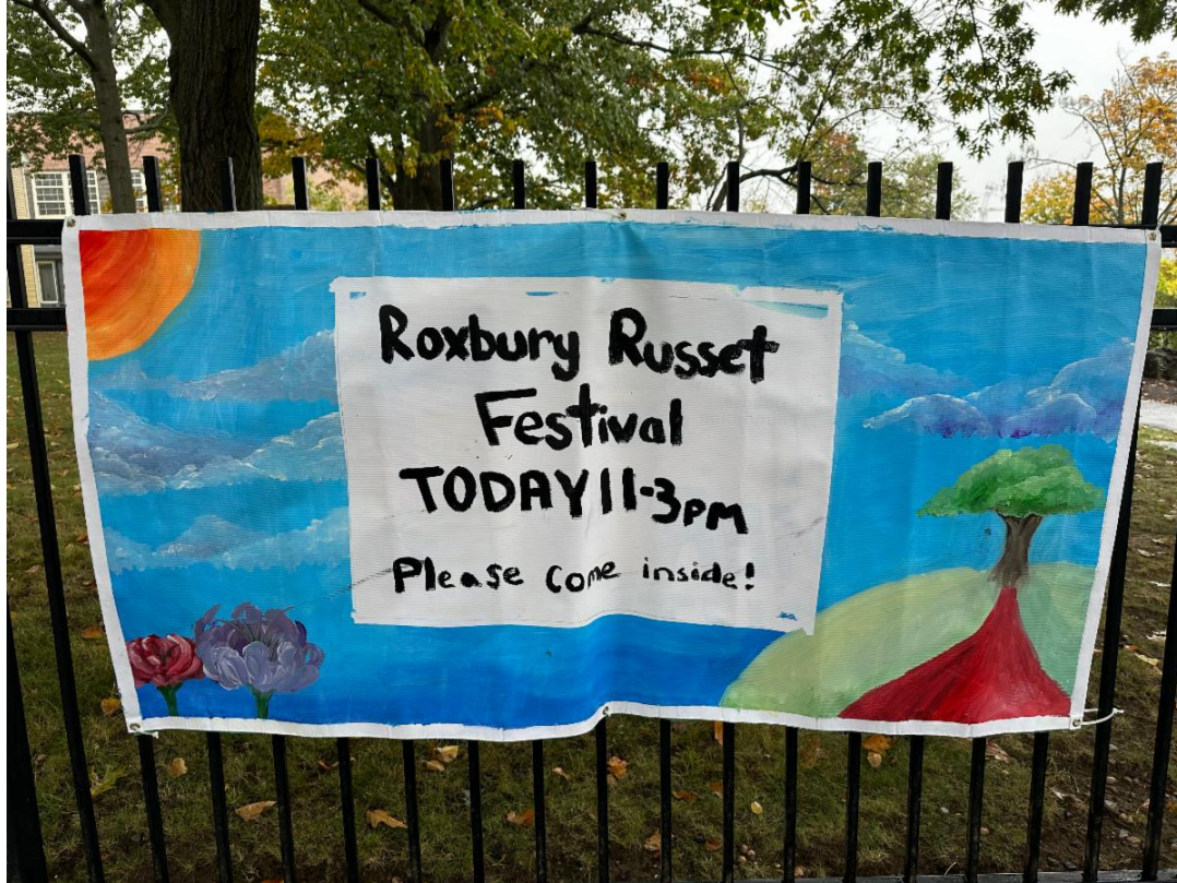
Above: The banner for the Roxbury Russet Festival that was created by one of the young people in Roxbury Youth Programs (RYP).