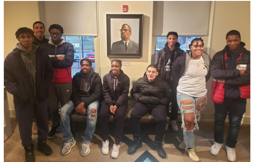
Roxbury Youth Programs participants in a position of learning (above), as they do research on a tour of the Dillaway-Thomas House and Roxbury Heritage State Park.