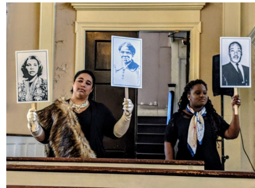
Castle of our Skins and Boston Lyric Opera combined creative forces in a moving performance, “Crossing the Line to Freedom” (left).

Social Justice Fellow for the Arts and Humanities