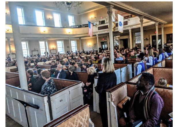
Youth from Handel + Haydn Society’s Chamber Choir line the Meetinghouse aisles for “Every Voice”, an annual collaboration that raises the voices of marginalized communities through music (right).