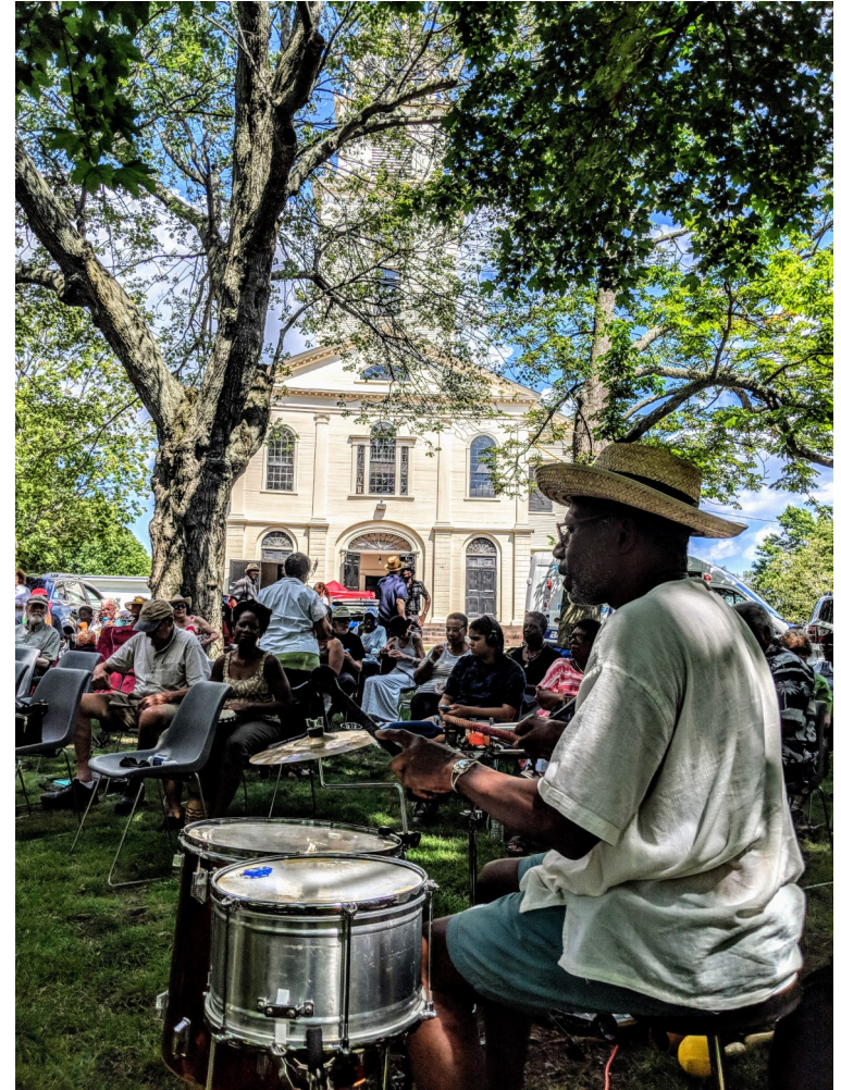
The Roxbury-based jazz ensemble, The Makanda Project, performs on the UUUM Green during a festive neighborhood gathering.