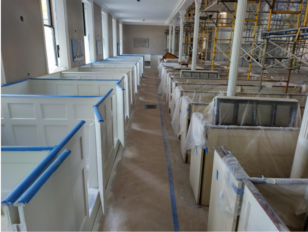
Before and After: On the right, a row of untouched pews covered in plastic, and on the left, a row where painting has begun.