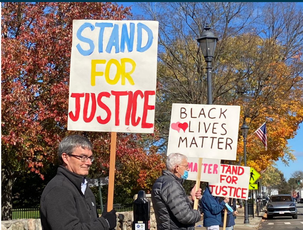
Members of the congregation at UU Wellesley Hills stand for their weekly Black Lives Matter stand out.

A few weeks ago I visited one of the UU Urban Ministry's member congregations where, every Sunday since George Floyd was killed, they hold a quiet streetside Black Lives Matter vigil.