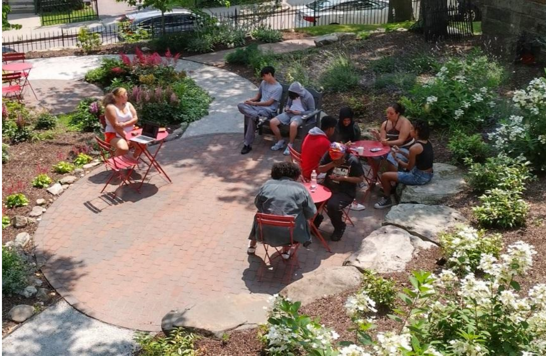
RYP Summer Interns moved outside to the peace garden, to work and enjoy a beautiful morning.

The summer semester of RYP started this week, and we welcomed ten interns - some who have been part of the program in the past and some joining for the first time.